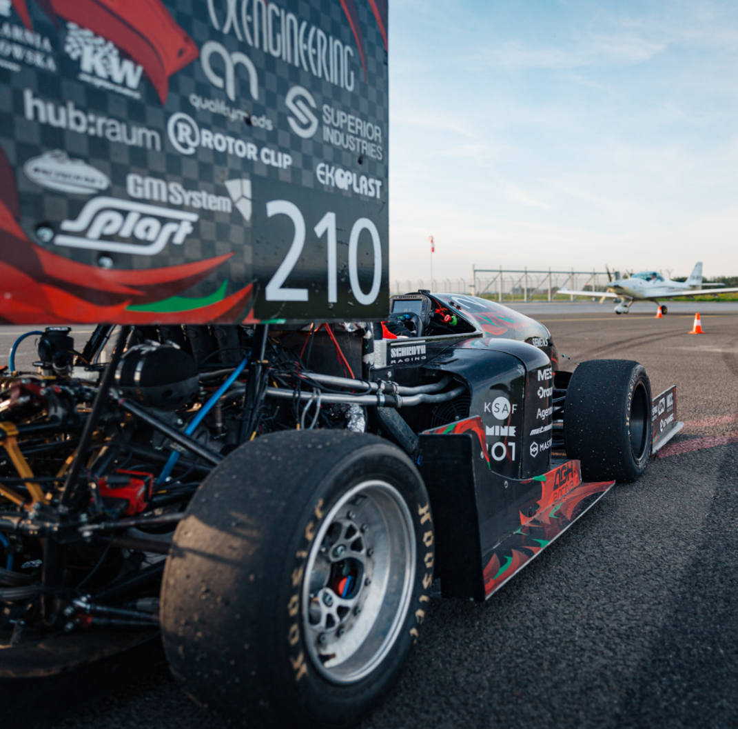
Our car at the airport in Krosno