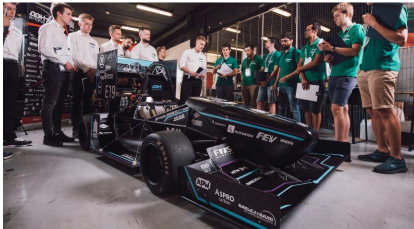
A coverage from static competition during FS Spain 2019

We are present on all major social networks, attracting new followers every day. We regularly publish materials from the life of the team, share our knowledge and promote the activities of our partners. The participation of AGH Racing in unusual promotional campaigns and events each time generates the reach of posts counted in tens of thousands of people.