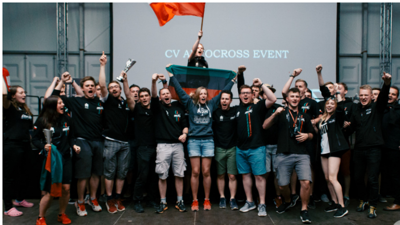
The award ceremony at FS Netherlands

In more spectacular dynamic events, the cars are tested under track conditions. The 5 competitions test the acceleration, grip, cornering behavior, reliability and economy of the cars.