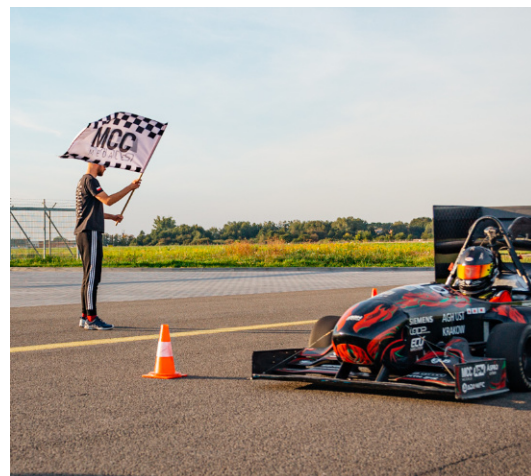
Example of benefits