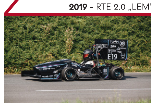
2019 - RTE 2.0 „LEM”