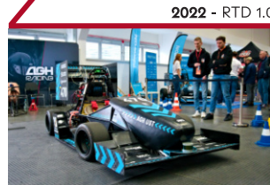
2022 - RTD 1.0

During over 10 years of our activity, we have managed to complete a total of 10 projects, including 7 cars built from scratch. Recently, this group also includes the first autonomous