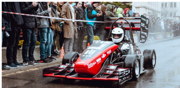
AGH UST Open Day 2019