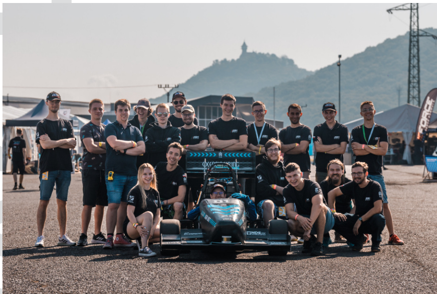
AGH Racing at FS Czech 2022

AGH Racing successfully takes part in international engineering competitions, conquering racing tracks around the world. Through the implementation of passion in advanced, interdisciplinary projects with a strictly practical orientation, we gain valuable experience and have excellent conditions for continuous development. Recent years in the history of the team were full of successes. AGH Racing won competitions at events in Australia, Spain and the Netherlands, and stood on the podium of competitions in Michigan.