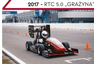
2017 - RTC 5.0 „GRAŻYNA”