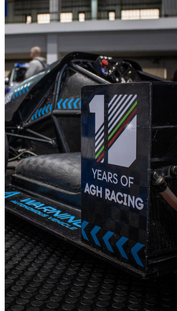
Jubilee painting of the car for the 10th anniversary of the team