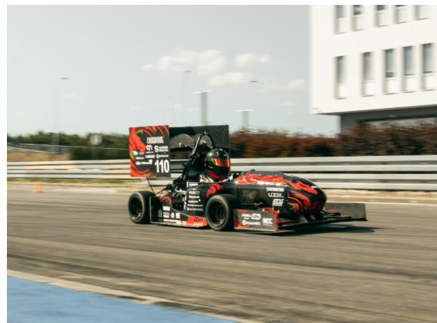
Our car during testing in 2021