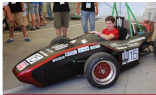
2013 - RTC 1.0 „GRUBA BERTA”