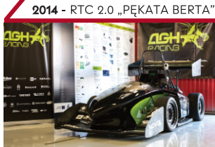
2014 - RTC 2.0 „PEKATA BERTA”