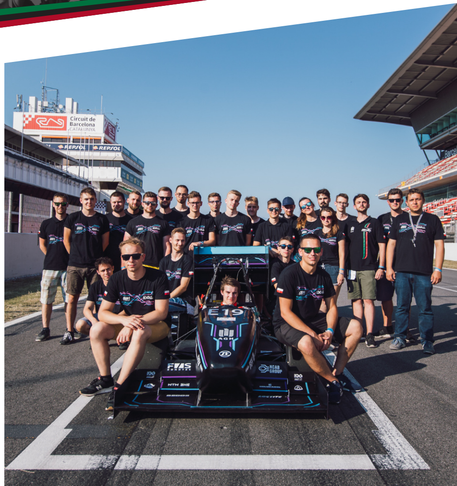
AGH Racing at Formula Student Spain 2019 competition

As one of the few teams of this type in the world, we develop three technologies in parallel: combustion, electric and autonomous. Moreover, we are the first team in Poland to build an electric car and an autonomous car, which shows that we have become the innovation leader among Polish students.