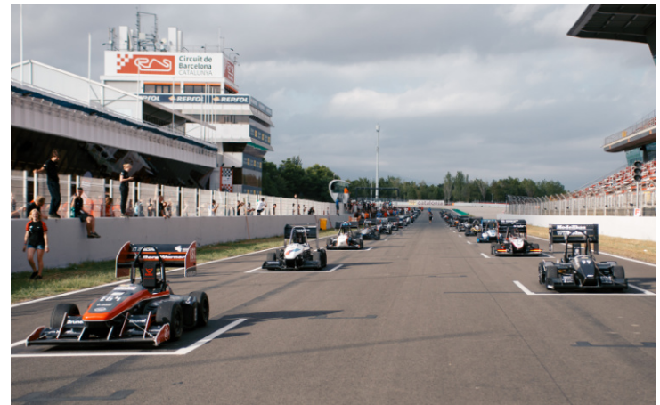
Race cars at FS Spain