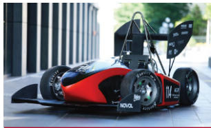
2015 - RTC 3.0 „BESTIA”