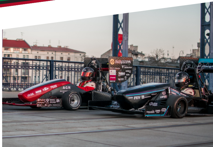
Recordings for a promotional video