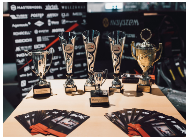
Our stand at „AGH Brainstorming” event