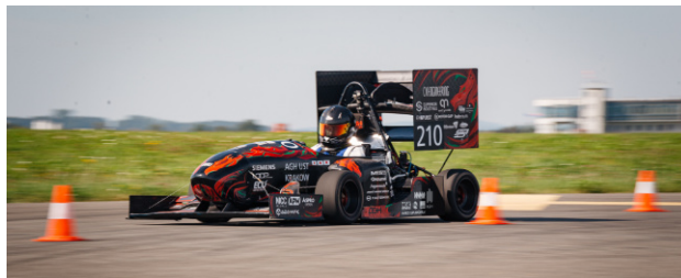
The car during testing in Krosno 2021