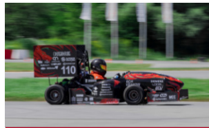
2021 - RTC 7.0